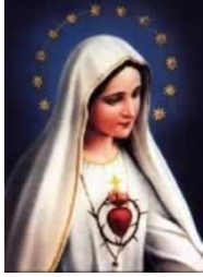
St. Mary, Mother of Christ Queen of the Knights